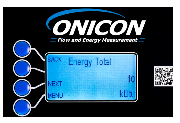
Smart button technology simplifies menu page navigation

11451 Belcher Road South, Largo, FL 33773 • USA • Tel +1 (727) 447-6140 • Fax +1 (727) 442-5699 www.onicon.com • sales@onicon.com